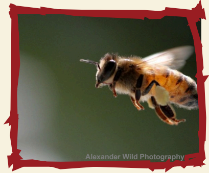
Alexander Wild Photography

When: Monday 11/14 & Tuesday 11/15 Time: 2 PM